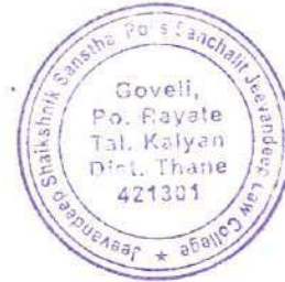
I/c. Principal Principal Jeevandeep Law College, Goveli Post Rayate, Tal. Kalyan, Dist. Thane - 421301

Students should be present for the campaign. Kindly make a note for the same.