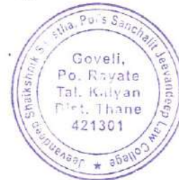
Principal Jeevandeep Law College, Goveli Post Rayate, Tal. Kalyan, Dist. Thane - 421301