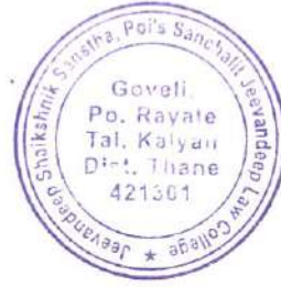
I/C.Principal Jeevandeep Law College, Goveli Post Rayate, Tal. Kalyan, Dist. Thane - 421301

Students should be present for the celebration. Kindly make a note for the same.