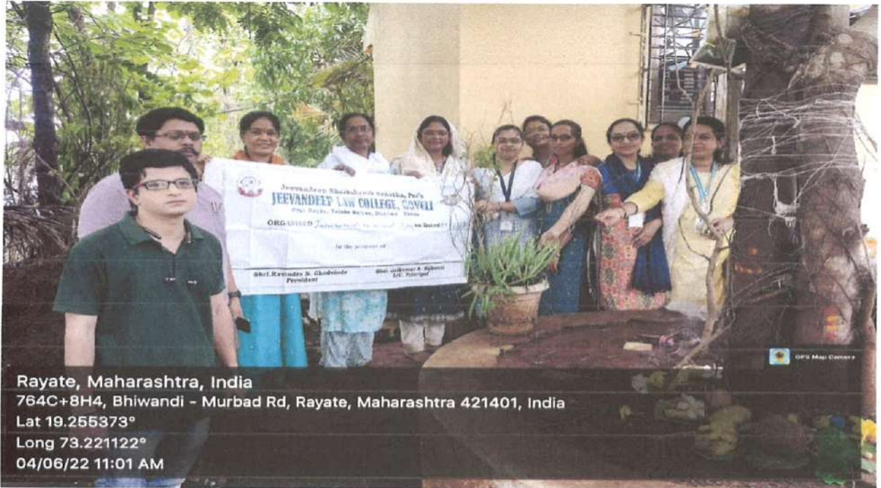
Rayate, Maharashtra, India 764C+8H4, Bhiwandi - Murbad Rd, Rayate, Maharashtra 421401, India Lat 19.255373° Long 73.221122° 04/06/22 11:01 AM