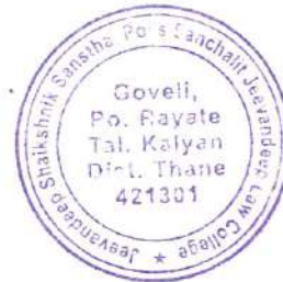
I/c. Principal Principal Jeevandeep Law College, Goveli Post Rayate, Tal. Kalyan, Dist. Thane - 421301

Students should be present for the campaign. Kindly make a note for the same.