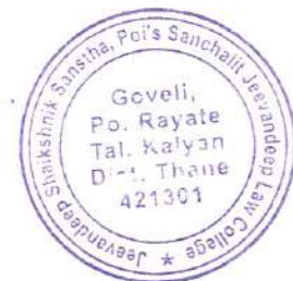
Principal Jeevandeep Law College, Goveli Post Rayate, Tal. Kalyan, Dist. Thane - 421301