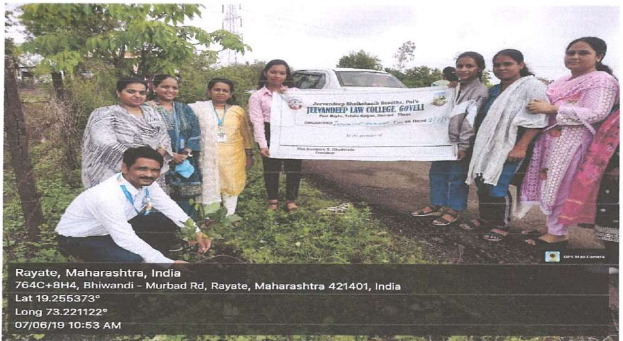
Rayate, Maharashtra, India 764C+8H4, Bhiwandi - Murbad Rd, Rayate, Maharashtra 421401, India Lat 19.255373° Long 73.221122° 07/06/19 10:53 AM