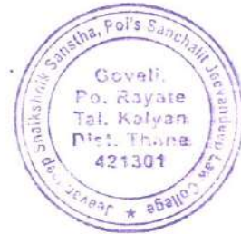
Principal Jeevandeep Law College, Goveli Post Rayate, Tal. Kalyan, Dist. Thane - 421301

The event provided an opportunity for the Law students to perform role play and deliver speech on different topics for the holistic development. A panel discussion was also conducted on "Human Rights" with an objective to create awareness about human rights.