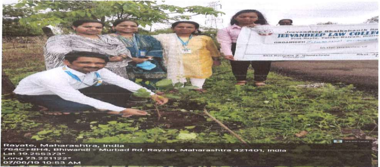
Rayate, Maharashtra, India 764C+8H4, Bhiwandi - Murbad Rd, Rayate, Maharashtra 421401, India Lat 19.255373° Long 73.221122° 07/06/19 10:53 AM