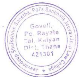
Principal Jeevandeep Law College, Goveli Post Rayate, Tal. Kalyan, Dist. Thane - 421301

The Environmental Day celebration was a resounding success, achieving its goal of raising awareness and promoting environmental conservation.