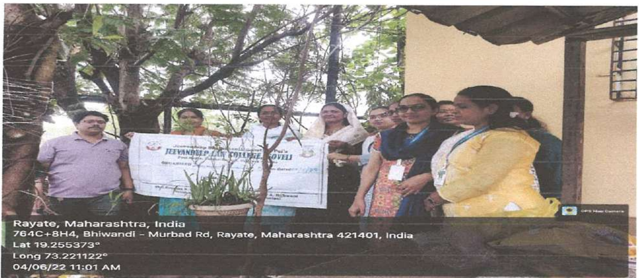
Rayate, Maharashtra, India 764C+8H4, Bhiwandi - Murbad Rd, Rayate, Maharashtra 421401, India Lat 19.255373° Long 73.221122° 04/06/22 11:01 AM