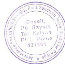
Principal Jeevandeep Law College, Goveli Post Rayate, Tal. Kalyan, Dist. Thane - 421301