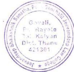
I/c. Principal Principal Jeevandeep Law College, Goveli Post Rayate, Tal. Kalyan, Dist. Thane - 421301

All pass out students are required to attain the function to make our endeavor a grant success.