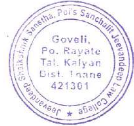
I/C. Principal Principal Jeevandeep Law College, Goveli Post Rayate, Tal. Kaiyan, Dist. Thane - 421301

Students who are interested, Kindly register your name in College staff.