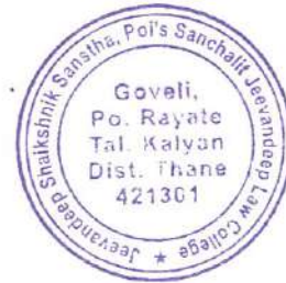
I/C. Principal Jeevandeep Law College, Goveli Post Rayate, Tal. Kalyan, Dist. Thane - 421301

Prizes will be given to first three winners. All the students are expected to participate enthusiastically.