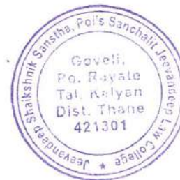
Principal Jeevandeep Law College, Goveli Post Rayate, Tal. Kalyan, Dist. Thane - 421301

After the speech games had started. The games were arranged in a sequence so as to avoid the confusion among the participants. Those who had participated in the games they had played very well. Our professors had monitored them while playing. At the end of the annual sports day celebration prizes were distributed to the winners and participated students.