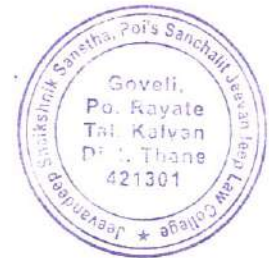
Principal Jeevandeep Law College, Goveli Post Rayate, Tal. Kalyan, Dist. Thane - 421301