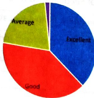
FeedBack 2022-2023 (students)

Teachers: The year 2022-2023 marked remarkable with highest student teacher ratio each teacher having a bullseye approach to enhance the students' understanding, technicalities and application of their respective subjects. They were true in their opinion through the feed backs which reflected in the analysis of the same.