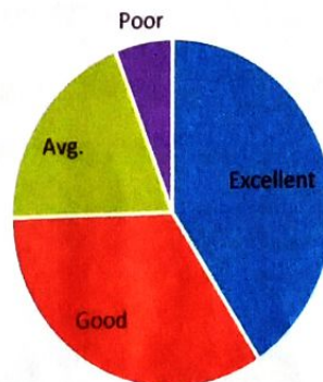
Feed Back on Syllabus 2022-2023- Alumni

Inference: Based on the above data analysis the institution strives to take affirmative steps in adopting methods and techniques to strengthen the scope of education imparted that shall be enumerated in the Action taken report.