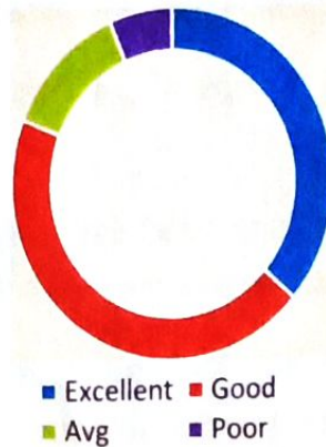
Feed Back 2022-2023- Advocates

Alumni: Our Alumni were proactive when they received notice that the college is keen on their feedback regarding the current syllabus and aspects related to the same. Their feedback suggests that the current syllabus is largely adequate in the processes of imparting legal education to future lawyers and Law Professionals.